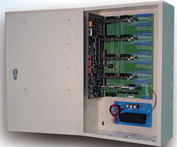
Model 508i - Eight Door Version

Modular design allows for easy expansion. Allowing control of up to eight doors per 508i panel (up to two on the Model 502i), multiple 508i and/or 502i panels can be linked together to create a custom system that is as large (or small) as needed.