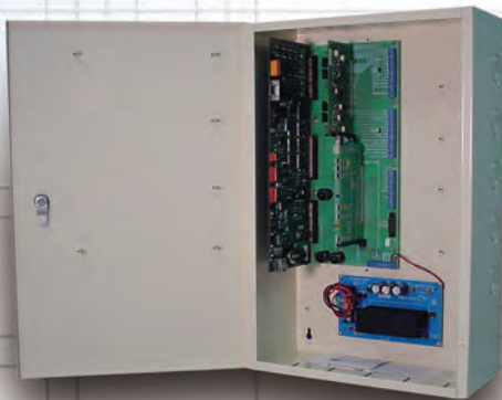
Model 502i - Two Door Version